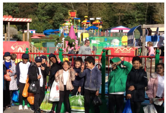
A great fun day out at Legoland for Year 4.